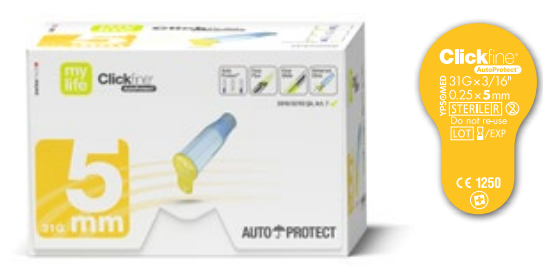
5mm, 31 G/0.25mm

The mylife<sup>™</sup> Clickfine<sup>®</sup> AutoProtect<sup>™</sup> pen needle is available in two different lengths: 5 mm and 8 mm. The 5 mm needle may be used without a skin fold technique minimising the risk of an accidential needle stick to caregivers during injection.<sup>3</sup>