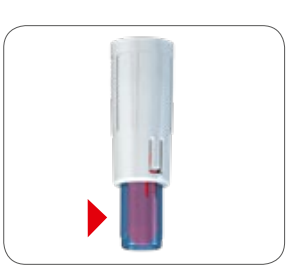
After injection: automatic locking and red locking indicator.