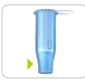
mylife<sup>™</sup> Clickfine<sup>®</sup> AutoProtect<sup>™</sup> with protective cap.