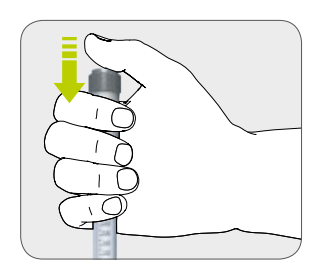
Now press the dose button and slowly administer the injection. Allow the pen needle to remain in the fatty tissue (count to 10 slowly).