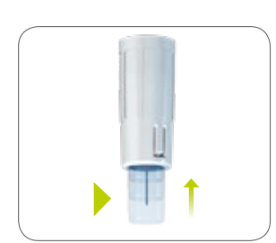
During injection: protective sleeve releases needle.

Before injection: cannula protected by protective sleeve.